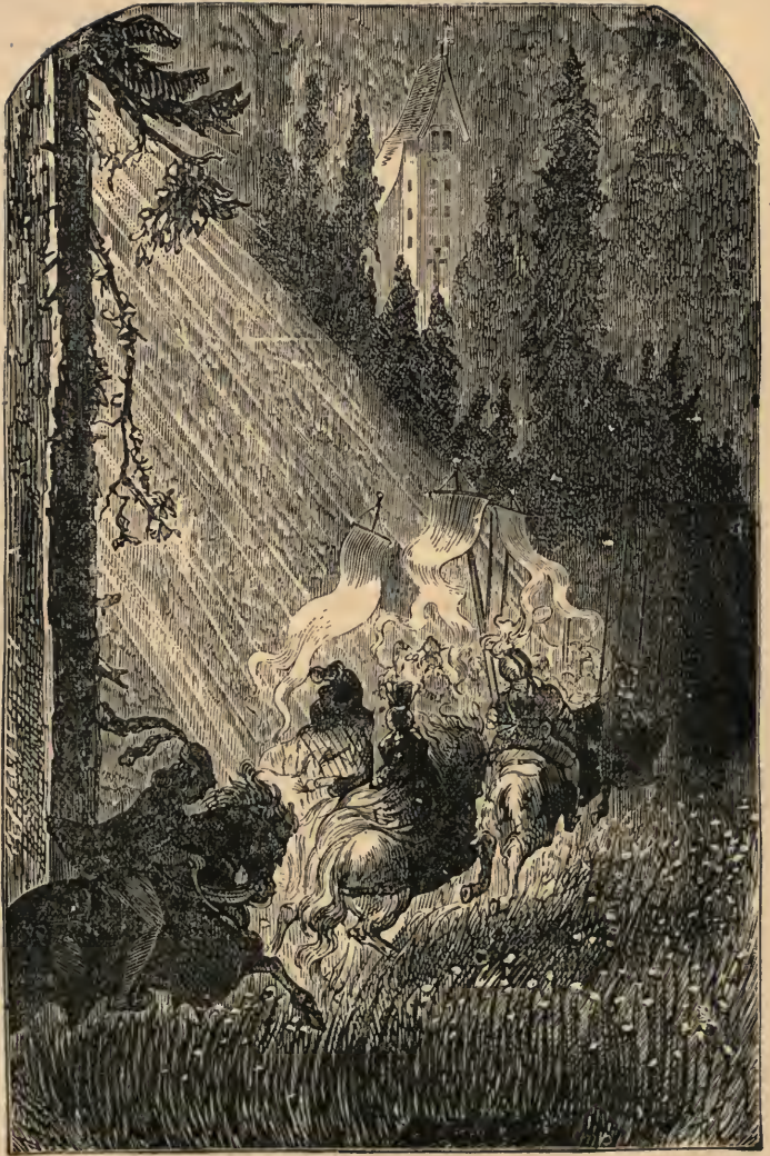
Then the same day Blanche set out towards Notre-Dame de l'Egrignolles.